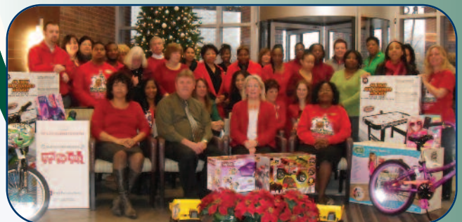
Main office staff shown with our Toys for Tots donations.

2014 North American International Auto Show tickets are available to be purchased for $9.00 a ticket at all DMCU branch locations!